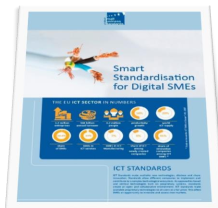
Sectoral brochures published in 2015

Improved representation of SMEs in the main sectoral advisory groups and TCs organised by the European Commission, the European Organisation of Technical Approvals (EOTA) and the European Committee for Standardisation (CEN), has facilitated the implementation of the Construction Products Regulation (CPR). Concerning the ICT sector, SBS aims to address issues