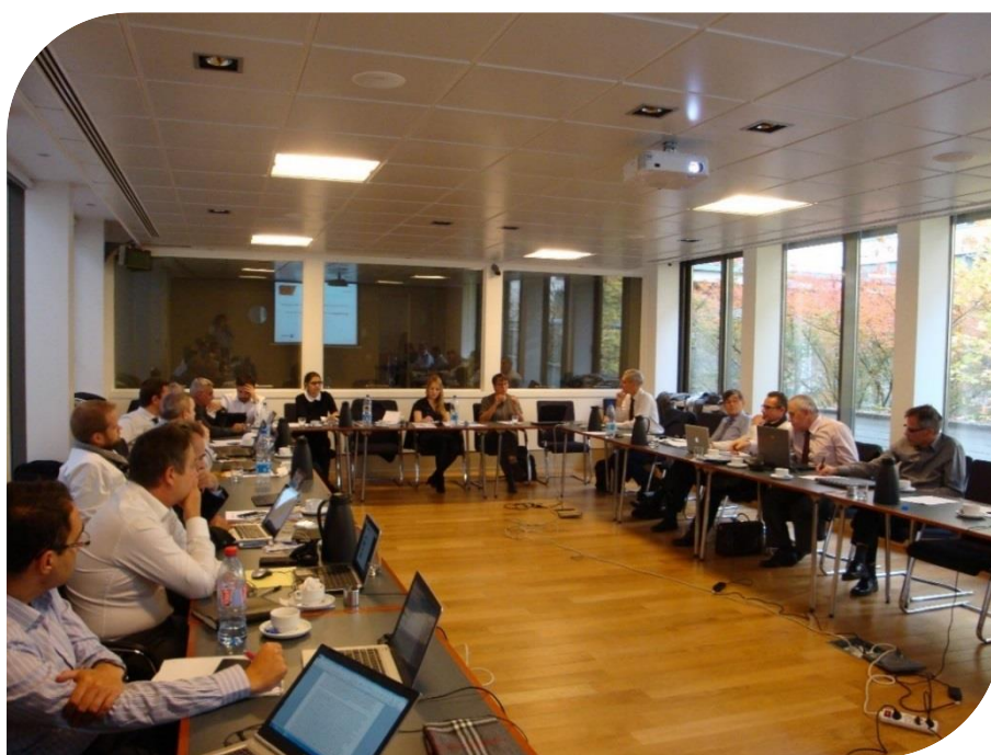
Expert meeting held on 30 October 2015

In 2015, SBS organised two meetings for its experts. Planned as training seminars, with external speakers, these meetings also enabled experts to meet each other and build important network structures with a view to exchanging expertise, experiences and strategies related to their work in representing SME interests in TCs and WGs. Moreover, these meetings were an opportunity to raise issues and discuss internal procedures and requirements such as the reporting requirements or the latest developments in the standardisation process.