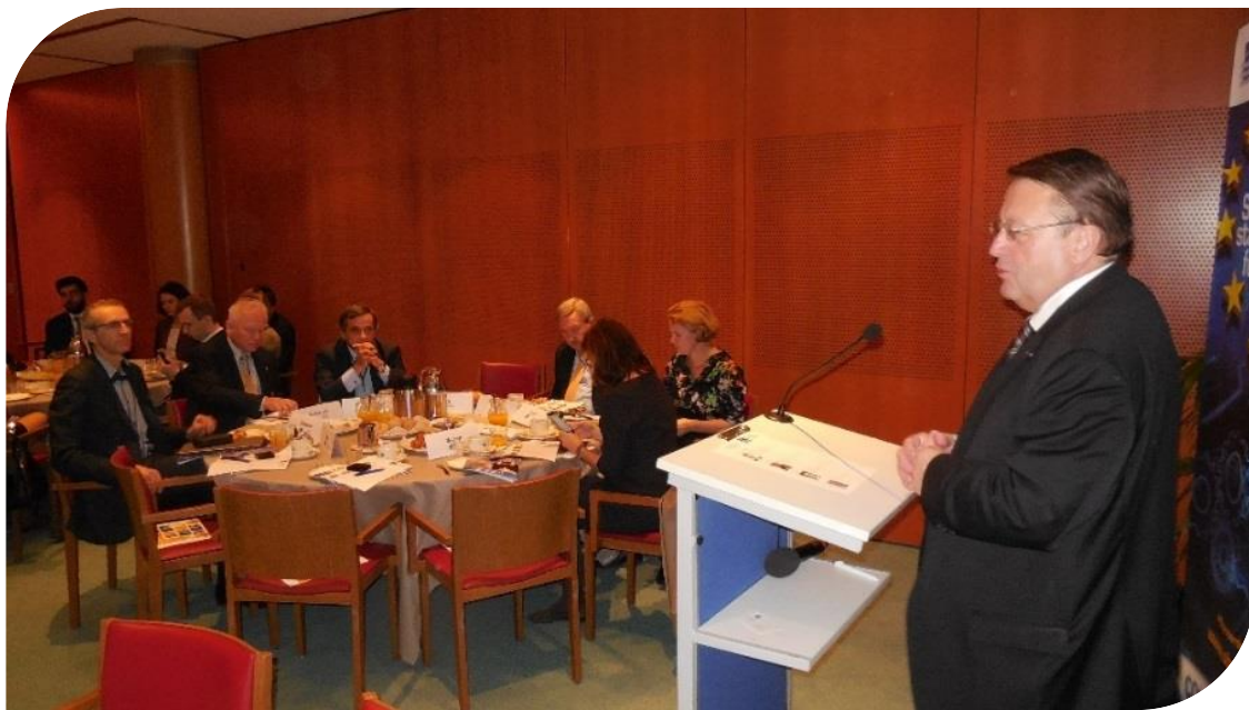
MEP Paul Rübig hosting the working breakfast organised in the European Parliament

A milestone occurred on the 3 rd of December 2015 taking the form of a working breakfast in the European Parliament entitled “European standards as a chance for SMEs”, moderated by MEP Paul Rübig, co-founder and Honorary President of SME Europe (EPP). At the event, SBS engaged for the first time with MEPs at policy level and informed them of standardisation for SMEs and its activities in the field. Additionally, SBS put forward the role of standards, the opportunities but also the challenges for SMEs. The breakfast was attended by high-level speakers and stakeholders representing both the public and the private sector.